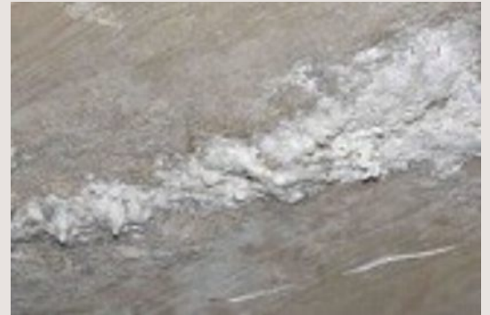
Example of secondary efflorescence in parking garage exposed to diluted road salt from vehicles entering the garage during winter.

Water flows through cracks in concrete dissolving minerals in the concrete.