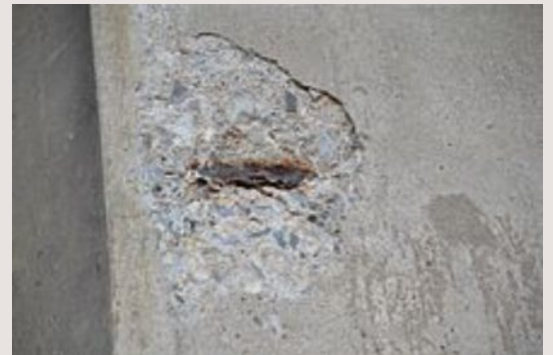
Example of flat piece of concrete having dislodged with corroded R-bar underneath.